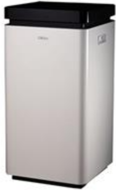
GG 02 6 KG / DAY