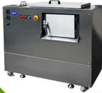
GG 10 30 KG / DAY