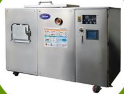
GG 30 90 KG / DAY