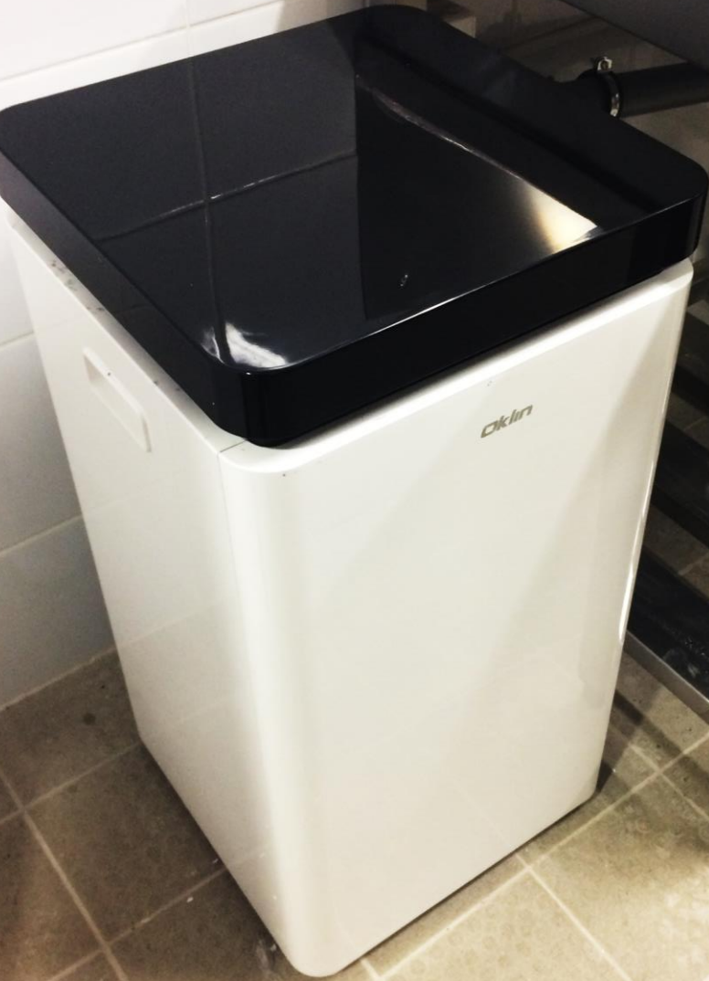
COMPOSTER GG02 PLACED IN KITCHEN AREA