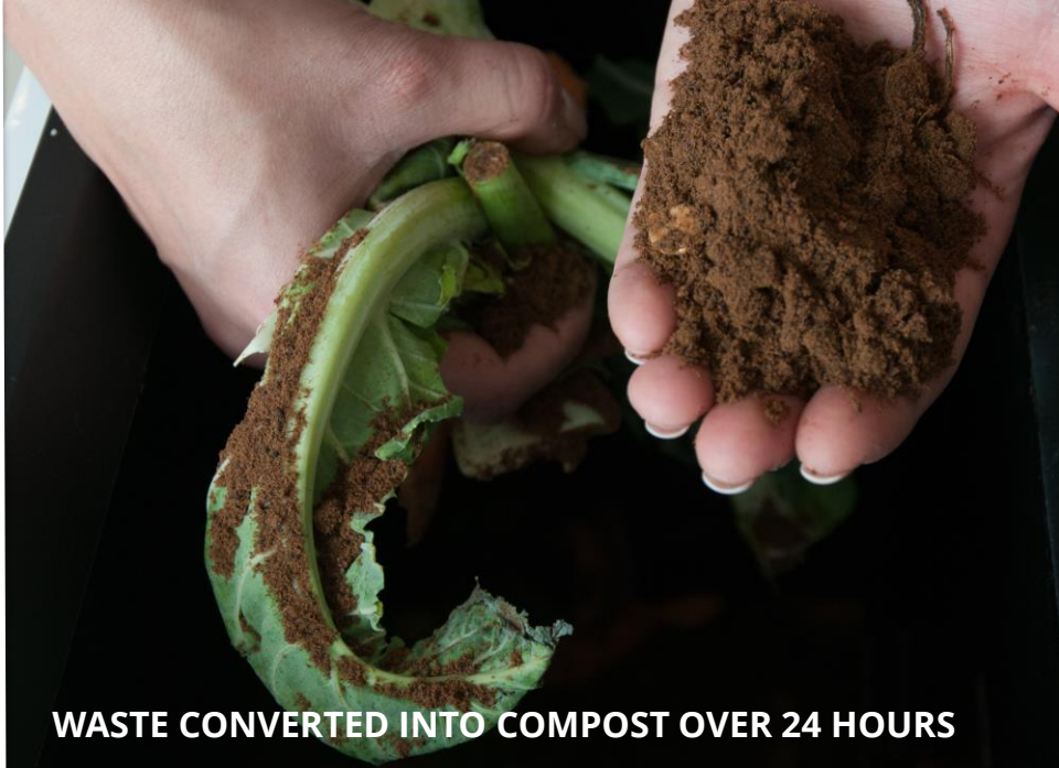
WASTE CONVERTED INTO COMPOST OVER 24 HOURS